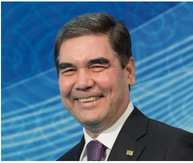
Gurbanguly Berdimuhamedov, Chairman of the Khalk Maslakhaty of Milli Gengesh of Turkmenistan;

Famous people who visited the forum in different years: