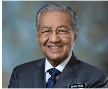
Mahathir Mohamad, former Prime Minister of Malaysia Malaysia and Chairman of the World Alliance for International Development Partnership (GAPID);