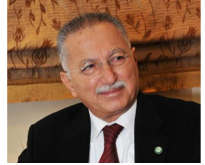
Ekmeleddin Ihsanoglu, former Secretary General of the Organization of Islamic Cooperation (OIC);