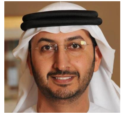
Abdullah Al Saleh, UAE Deputy Minister of Economy;