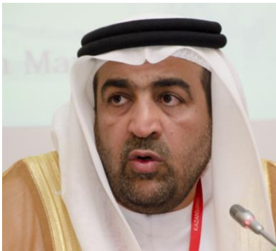
Rashid bin Ahmad bin Fahad, UAE Minister of State for Standardization and Metrology;