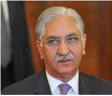
Syed Nayyar Hussain Bokhari, Chairman, Senate of Pakistan;