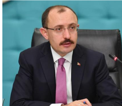
Mehmet Muş, Minister of Trade of the Republic of Turkey;