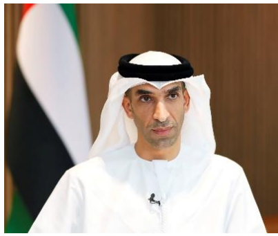
H.E. Dr. Thani Ahmed Al Zayyoudi, Minister of State for Foreign Trade of the United Arab Emirates. Minister of State for Foreign Trade of the United Arab Emirates;