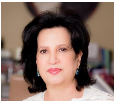
H.E. Sheikha Mai Bint Mohammed Alkhalifa, President of the Bahrain Authority for Culture and Antiquities;