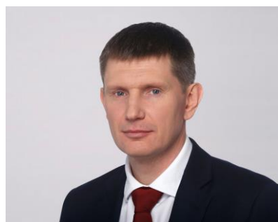
Maxim Gennadyevich Reshetnikov, Minister of Economic Development of the Russian Federation;