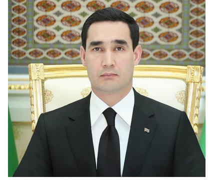
Serdar Berdimuhamedov, Chairman of the Legislation and Norms Committee of the Mejlis of Turkmenistan;